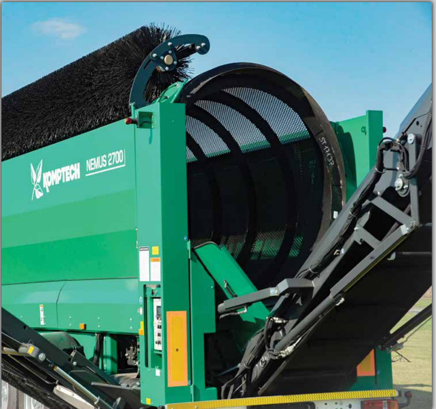
The Nemus 2700 mobile hydraulic drum screen is built for high throughput screening of heavy soil, compost, mulch, and other waste materials.