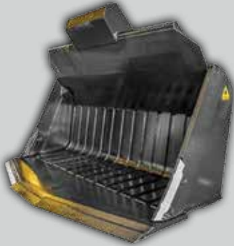
Dymax General Purpose Buckets for Wheel Loaders, Track Loaders, Toolcarriers and Telehandlers are designed and built to provide years of productive use and service