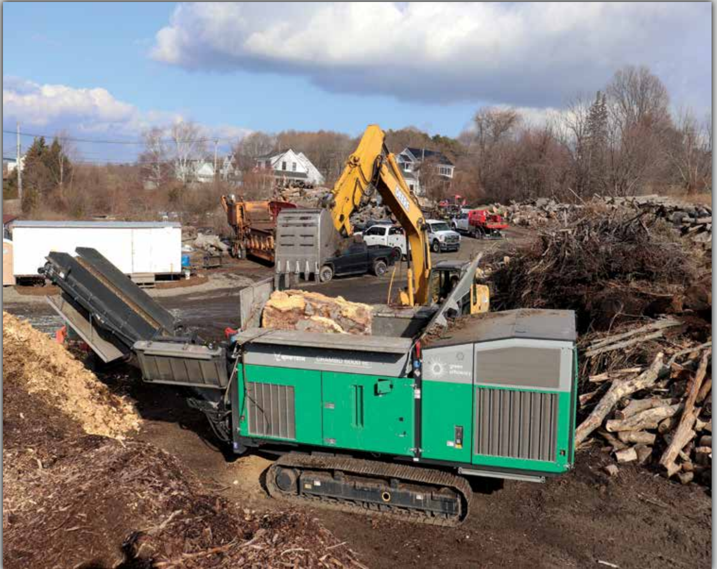
Komptech's Crambo is a low-speed, dual-shaft shredder engineered to deliver high-throughput shredding for wood and organic waste.