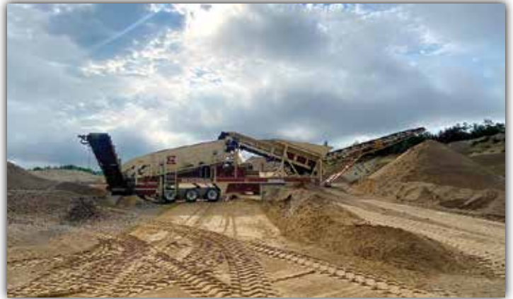
All American made, R.D. Olson has been building quality crushers, screen plants, conveyor systems, and washing plant gear for more than 35 years.

If it is in the aggregate category of material processing, R. D. Olson crushes it, washes it, screens it, or separates it. To really get the complete story on all the products available, to learn more, go to www.rdolsonmfg.com .