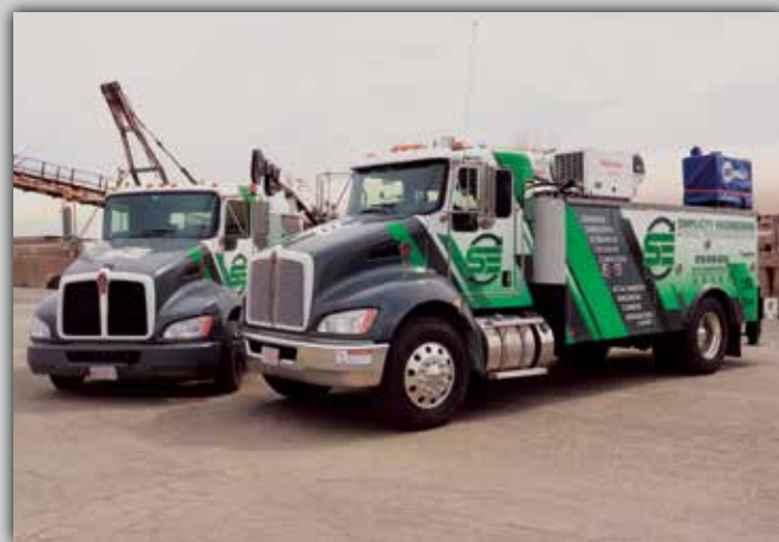
Simplicity Engineering has a fleet of service trucks to provide quick, onsite service with 24/7 emergency availability.

Simplicity Engineering certified welders and fabricators can complete any job to exact specifications, from attachment fabrication or modification to structural repairs or specialized accessory manufacturing. With a full-service paint shop, we can match the machine color of any manufacturer to restore your equipment to a "like-new" condition. Our expert painters can handle any job, big or small, and apply all decals to your specifications.