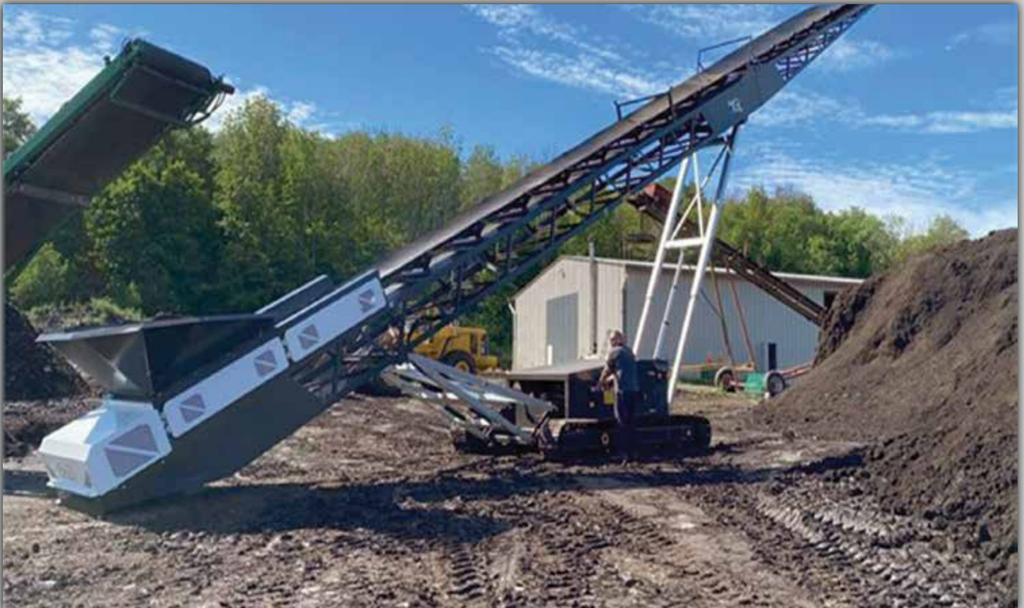
The MGL 842 T is an 80' tracked stacker with a conveyor that has a 42" wide smooth belt, a reversing fan, and a fuel-efficient motor.

When it comes to conveyors, no one matches MGL's experience, quality, and reliability. To really get the complete story and all the products available, go to www.mglengineering.com/conveying .