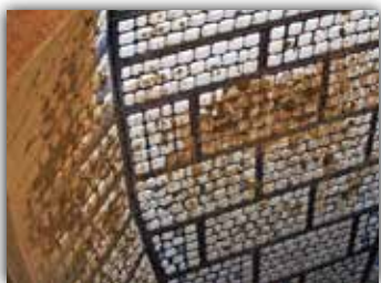
This unique wear-resistant liner features high alumina ceramics combined with the energy-absorbing characteristics of high tensile premium rubber.

Corrosion Engineering's haul truck bed liners provide exceptional wear and impact resistance to dramatically increase availability, decrease maintenance, and improve productivity in your fleet