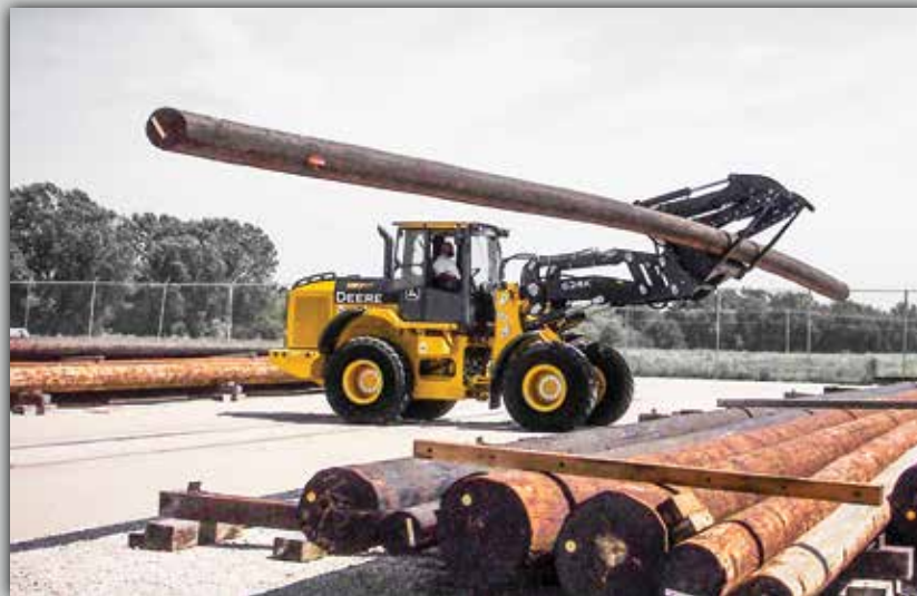
Dymax accessories are suited for machines with higher breakout forces, and are designed to match individual loader characteristics, typically yielding additional capacity and production.

accessories you may need for construction, material processing, agricultural, and mining equipment, log onto www.dymaxinc.com .