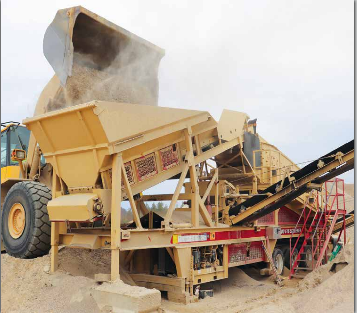
Tough as the materials it screens, the RDO 616 screener is available in 2- or 3-deck models and thoroughly sorts rock, stone, concrete, and sand.